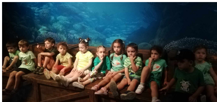
Mġarr - At the Aquarium