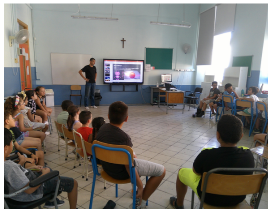
Marsa - Eskills