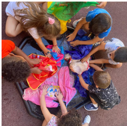
Marsa - Washing Day