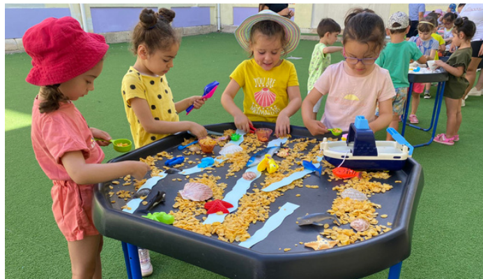
Żurriq - Messy Play