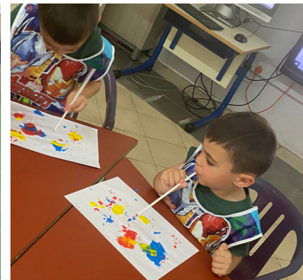
Floriana - Blow Painting