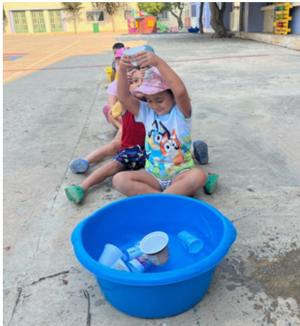
Qrendi - water games