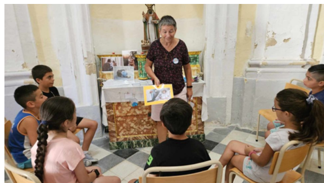
Qrendi - Prayer Spaces in Schools Malta