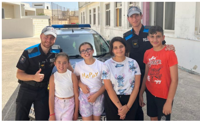
Dingli - Community Police