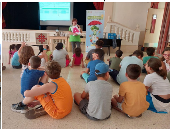
Birżebbuġia - ARPA