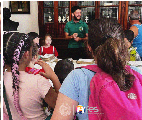
Haż-Żebbuġ - Għaqda Każin Banda San Filep