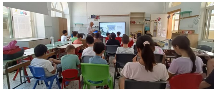
Lija/Balzan/Iklin - Central Bank of Malta