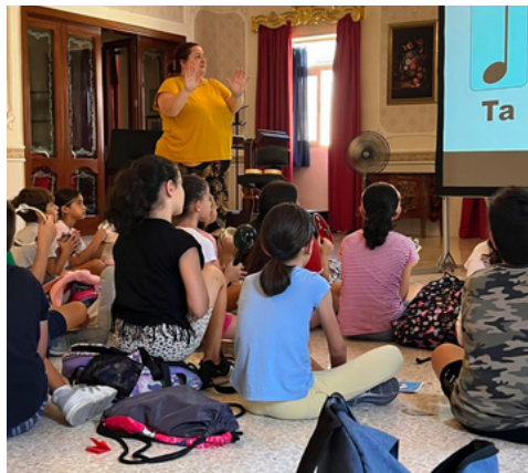
Haż-Żebbuġ - Music 4 You 12th May Band & Social Club