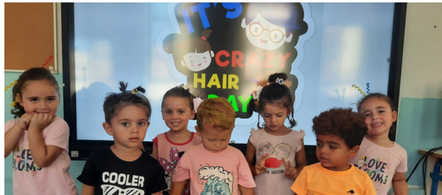
Siggiewi - Crazy Hair Day