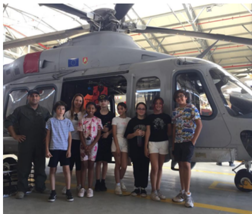
Żejtun - Armed Forces of Malta