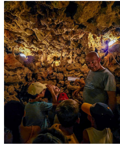
Xaghra - cavernous adventure