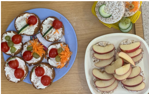
Xghajra - Healthy Cooking Activity