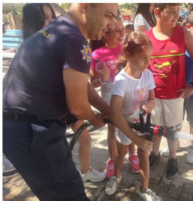
Safi - Civil Protection Malta