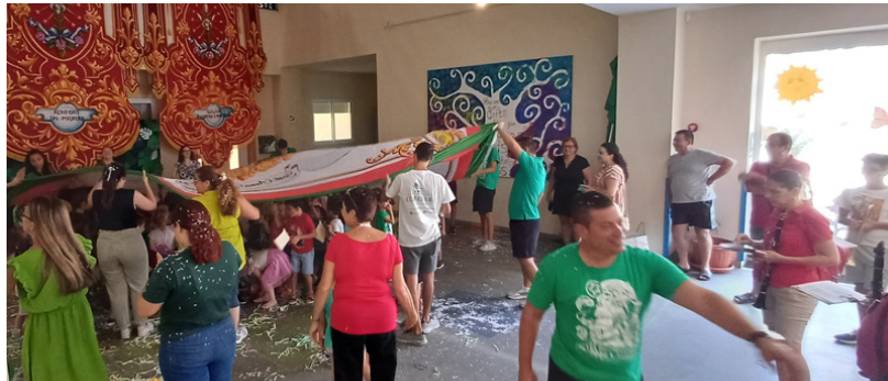
Marsascala St Joachim - Celebrating the feast