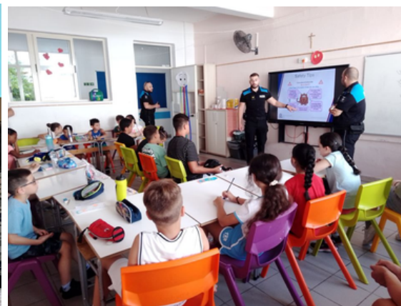
Valletta - Community Police