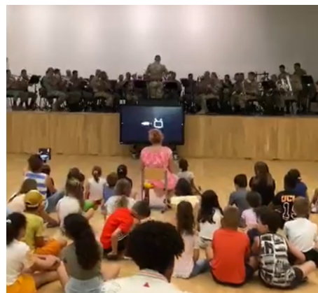
Qawra - AFM Military Band